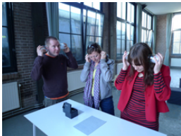
etude no.12 - plastic film -

World Wide Straw Foundation (project) - One Straw Can Change Your Life (?) -