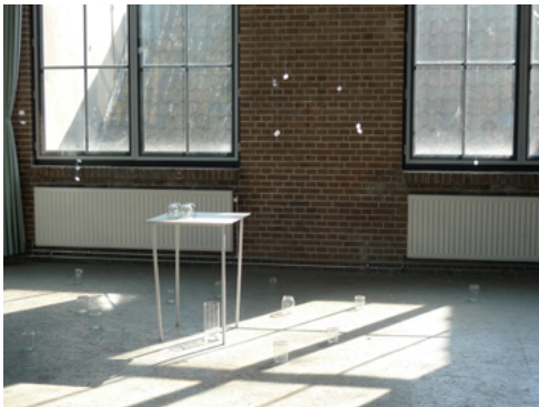
etude no.13 - ice -