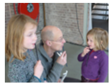
etude no.7 - plastic straw -